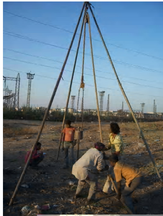
Fig. 1: DCPT Conducted at Bhatar Open Waste Dump Site

driving the cone through a specified distance was a measure of the dynamic cone resistance. DCPT has been conducted as per (IS: 4968 – Part I – 1976, reaffirmed 1997). A dynamic cone test has been performed by using a 50 mm cone without bentonite slurry. The number of blows for every 10 cm penetration was recorded. The number of blows required for 30 cm of penetration was taken as the dynamic cone resistance. The method adopted to improve open waste dump site properties was low pressure cement grout. In a hole of 5cm having 6m depth was grouted with low pressure cement grout as shown Fig.2. The cement grout used was having proportion 1:10. After a period of one week Dynamic Cone Penetration Test was carried out at 450 mm away from the hole to check the improvement in the geotechnical properties of landfill. Two Dynamic cone penetration tests were carried out on either sides of hole.