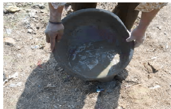
Fig. 2: Application of Low Pressure Cement Grout